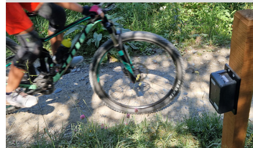
Can be integrated into a wooden post.

SMART MOBILITY SOLUTIONS PRODUCT CATALOGUE